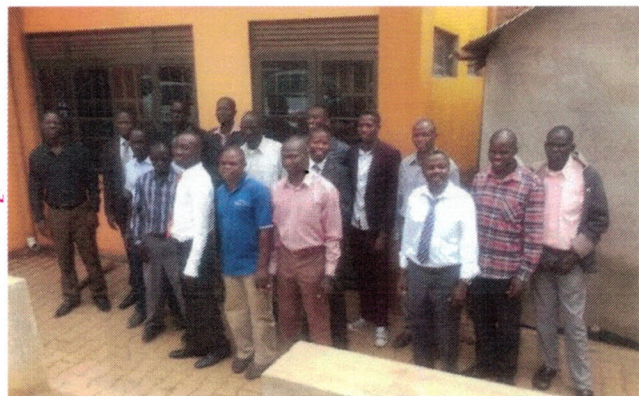
February 25 th gathering from three Ugandan regions

Four books will be provided for our August participants. The "African Bible Commentary", developed by African biblical scholars, is an exceptional tool for biblical insight of the African theological landscape. "Prosperity" is provided for international pastors by the Gospel Coalition and "The Disease of the Health and Wealth Gospel" is a timeless piece written by Dr. Gordon Fee. "Basic Christianity" is John Stott's classic affirmation of the call to follow Christ in discipleship.