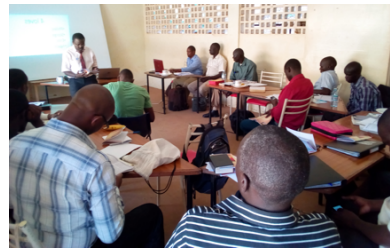
Training the Trainers Kampala, Uganda February 13-15