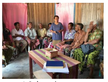
A So'e welcome