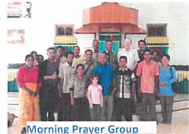
Morning Prayer Group