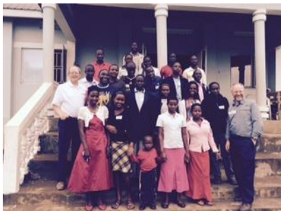
Emerging Leaders in Masaka