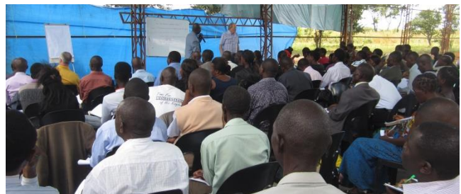
Over 100 pastors and church leaders gathered for training at Choshen Farm in Fimpulu, Zambia