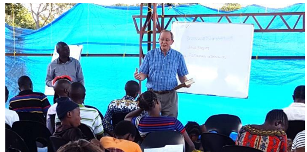
Teaching through the OT Prophets and their message for today