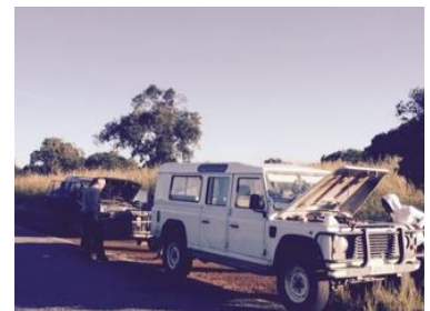
Exciting travel adventures in Zambia