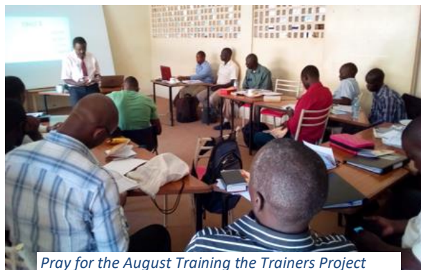
Pray for the August Training the Trainers Project

Thanks to our global partners and the many supporters that pray and offer support to what God is doing through “Partnerships”. We are grateful for New Horizons Foundation and their fine work behind the scenes that provides assistance at many levels. Most of all, we thank the Lord for the privilege of serving Him and His kingdom in this way