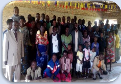
A group picture from Bulimbale B/C