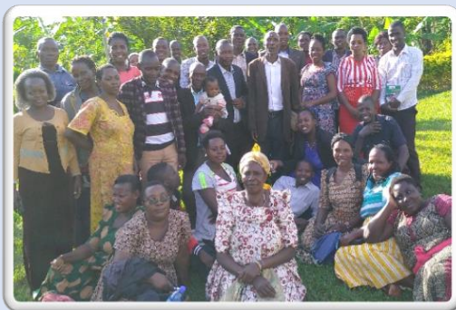
A group picture from Kinoni Baptist Church after the 2 days training.

We were able to fit within our budget. We spent about $ 644.10.