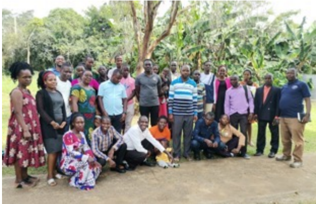
Masaka Emerging Leaders Gathering