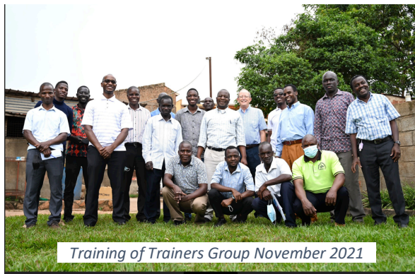
Training of Trainers Group November 2021

BACKGROUND – Because equipping pastors and emerging leaders is crucial to the ongoing health of the African church, Kampala Baptist Church and Partnerships for Training Pastors developed a strategy to meet this need. Working with leaders of the Baptist Union of Uganda, a group called Training of Trainers (TOTs) was formed in 2017. Participants came from Oyam, Masaka, Uganda's Central Region, and Kampala. This group of 20 TOTs met four times a year over three years to study the Bible and become equipped to teach