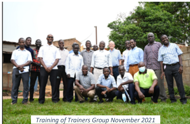
Training of Trainers Group November 2021

TOT Group- Equipping pastors and young emerging leaders is crucial to the ongoing health of the African church. In 2017, we developed a strategy to meet this need and formed a group called Training of Trainers (TOTs) . Twenty participants from Oyam, Masaka, Uganda’s Central Region, and Kampala met four times a year over three years to study the Bible. These trainers now work together to offer seminars for pastors and other church leaders in their regions of Uganda. In 2024, the TOTs will meet three